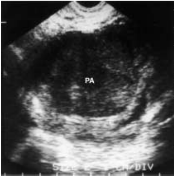
Figure 1 Transvaginal ultrasound image of a pelvic abscess (PA).